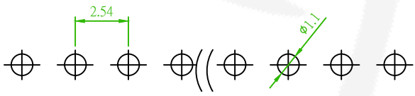
Recommended PCB Layout (PCB TOLERANCE ±0.1)